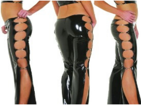
Who wouldn't go for more pants like that!?

... d20+your life from front explorer of ancient cities of creatures not like ourselves. It belies secrets and rituals that reveal truths about our existence that would drive the mortal insane. Facebook was copied by Mark Zuckerberg from the work of his [at-the-time] friends. It instead attracts the insane to it, and steadily wears upon their sanity with mind numbing 'games' and the social obligation to bear their soul in text for all to see. We can see that it renders people mentally unfit - just look at how it affects their language. Words being spoken in arcane codes and numbers, like some vile spell casters. While the Necronomicon may tell you how to summon a mind-warping Old One, the Facebook has been far more successful in ruining more minds,