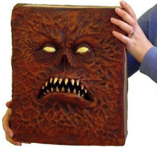
Mmmm... Tasty. The Necro-Nom Icon